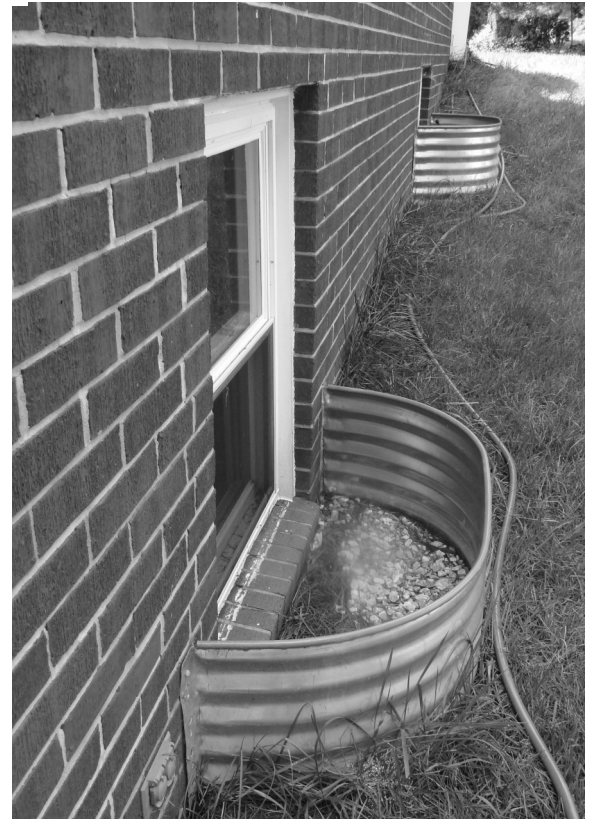
How to compensate for areas with high water flow.

Please consult local codes regarding window and window well installation. The width of the window well needs to be the width of the window plus a few inches on either side. Projection is determined by whether or not it needs to be an egress well. Egress windows need at least a 36" projection in the USA. Depth into ground is determined by the depth of the window below grade plus 8-12".