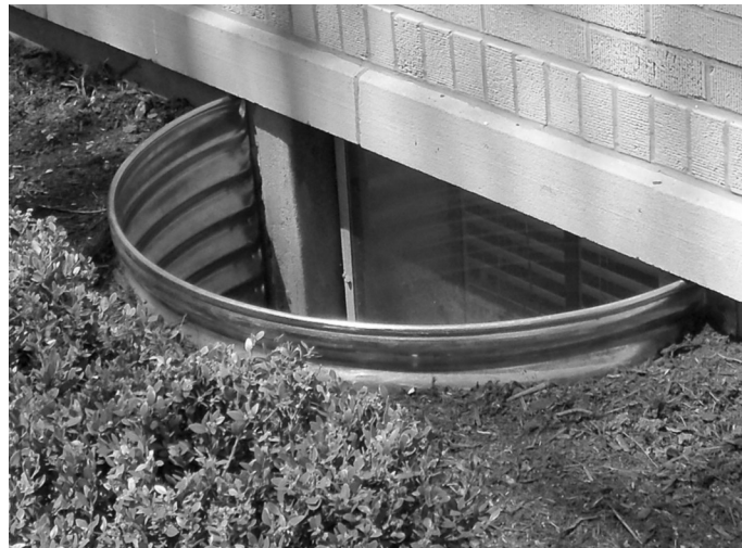
Standard window well installation

Please consult local codes regarding window and window well installation. The width of the window well needs to be the width of the window plus a few inches on either side. Projection is determined by whether or not it needs to be an egress well. Egress windows need at least a 36" projection in the USA. Depth into ground is determined by the depth of the window below grade plus 8-12".