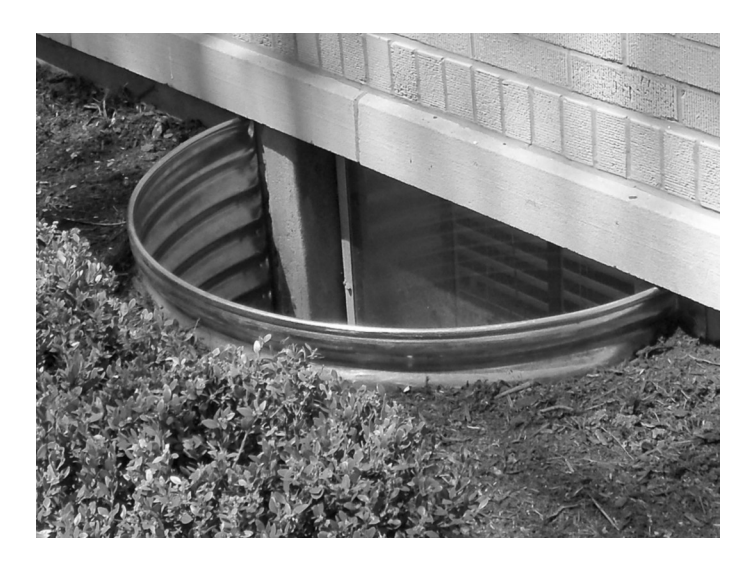
Standard window well installation